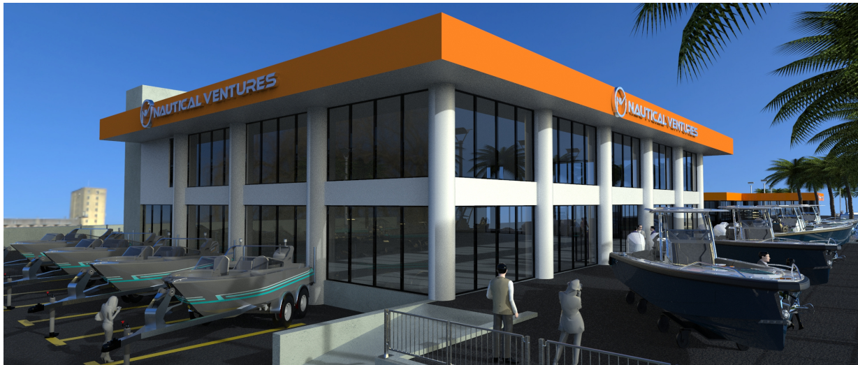
Boat Showroom – North Building

Ft. Lauderdale, FL. Nautical Ventures Group has purchased the property at 1400 S. Federal Highway (U.S. 1) in the heart of Ft. Lauderdale, FL. According to Roger Moore, CEO of Nautical Ventures Group, “This site was previously a BMW dealership, so the existing infrastructure and site plan allowed for a natural transition to bring over our unique boat dealership model.” A prominent, elevated roadside display area will feature the latest European and domestic boat brands.