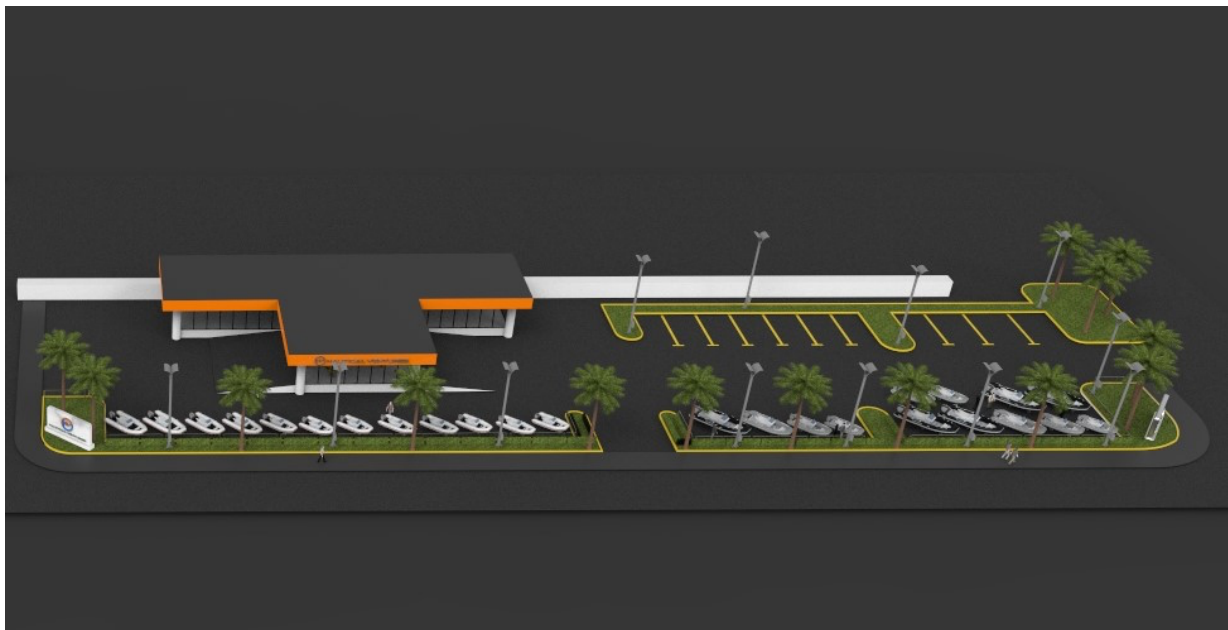
Tenders & Toys Showroom – South Building

Nautical Ventures Group is the recipient of Boating Industry's Top 100 Dealer Award, for five consecutive years, and ranked #11 nationwide for 2020. South Florida Business Journal currently ranks Nautical Ventures at #5 by revenue in South Florida.