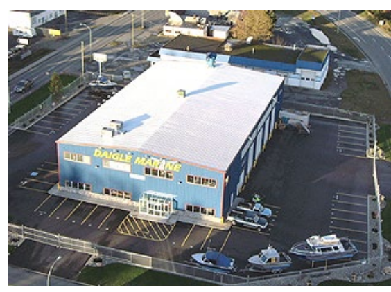
Campbell River, BC 16,500sq ft. facility www.eaglecraft.ca