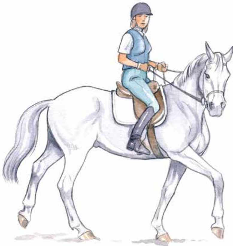
How not to turn right – showing overuse of the right leg and right rein – a common sight.

From years of teaching experience, I believe this most common fault starts below the belt. It concerns the rider's right leg. Overuse of the leg causes an imbalance in the seat which, in turn, forces the rider to overuse the right hand. Instead of making the horse more supple to the right, it generally does the opposite. This is particular noticeable in turns and circles.