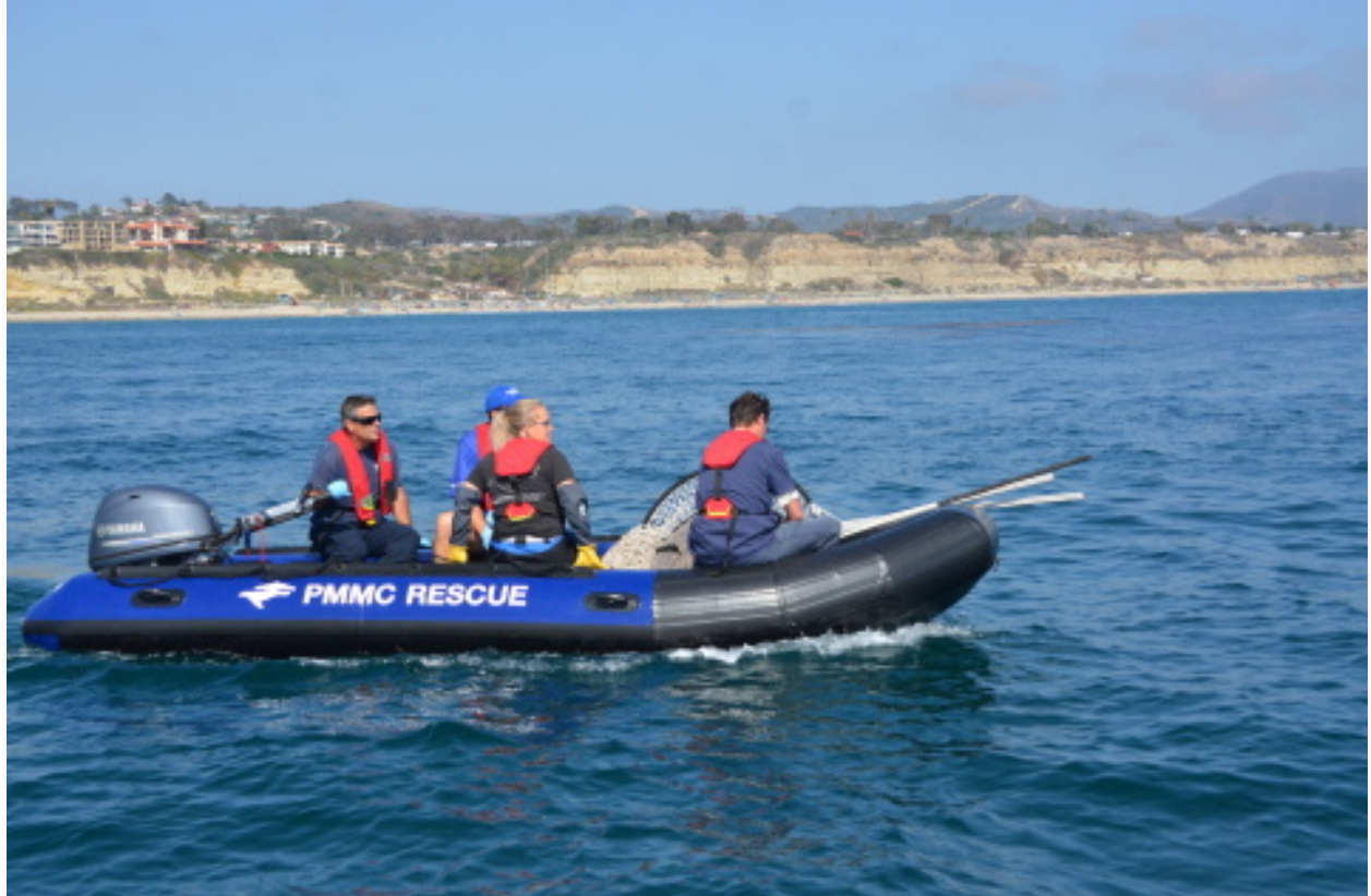
Pacific Marine Mammal Center and SeaWorld volunteers use newly-donated Yamaha F40 outboards for marine mammal rescue on the Pacific Coast.